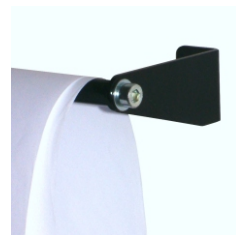
Wall blue-prints hanger for not yet folded documents