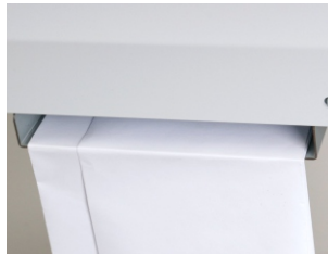
Tray for marking the crossfold position