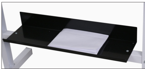
Storage shelf for folded blue-prints